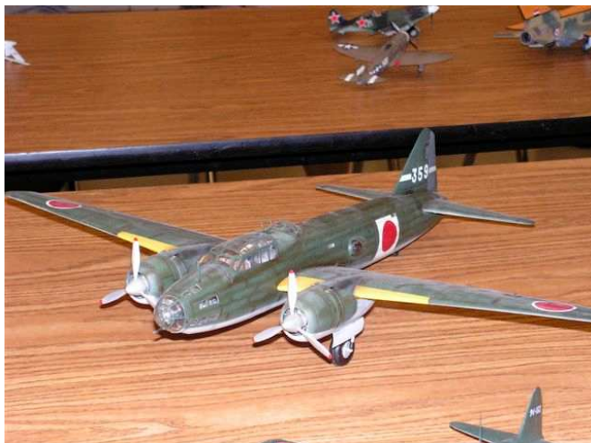
Another green aeroplane with red circles. I'm beginning to sense a pattern here.