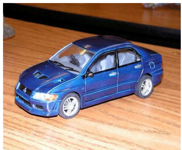
A blue car. I'm thinking "Mitsubishi" here.