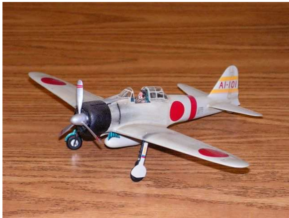
A grey aeroplane with red circles