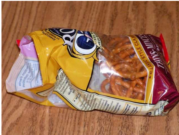
A perfectly detailed 1/25 scale bag of pretzels.