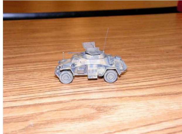
A wee tank.