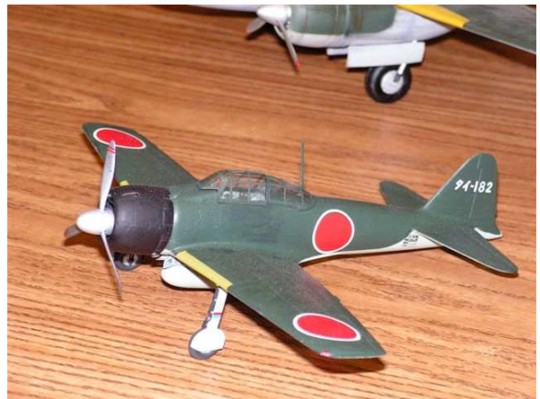
A green aeroplane with red circles