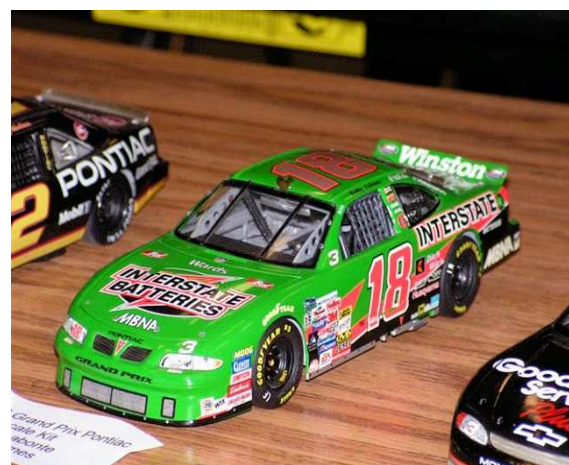
This page (from top): A well weathered 41 Chev, some kind of tankie thing, a cute little truck, Kyle Petty stock car, Dale Earnhart stock car, some other guy's stock car.