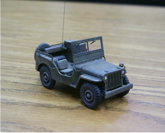
1/48 scale Verlinde Jeep-Dave Porter