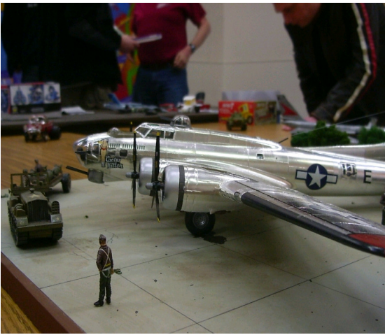
1/48 Revell B-17G Flying Fortress-Michael Evans