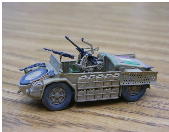
1/72 Italeri Saharianna-Al Magnus