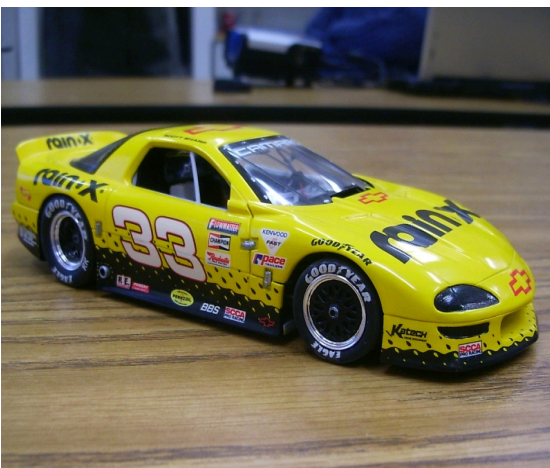
1/25 Revell Rain-X Camaro Race Car-Dave Porter