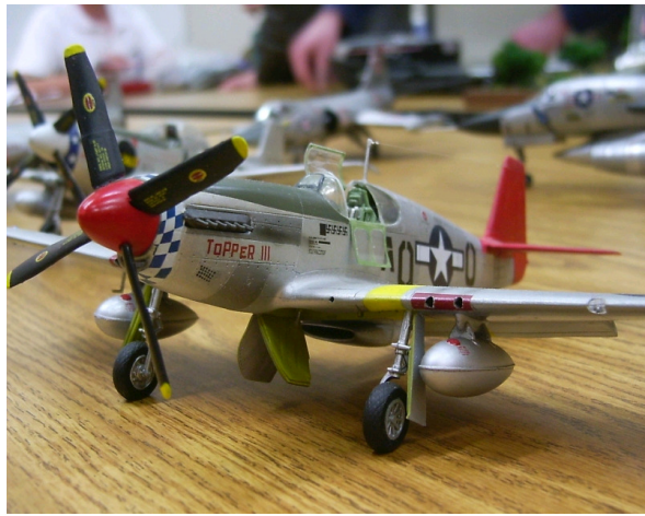
1/48 Pro-Modeler P-51C Mustang-Colin Kunkel