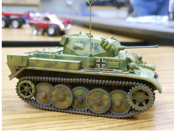
1/34 Tosca PzKpfw III-Cam Barker