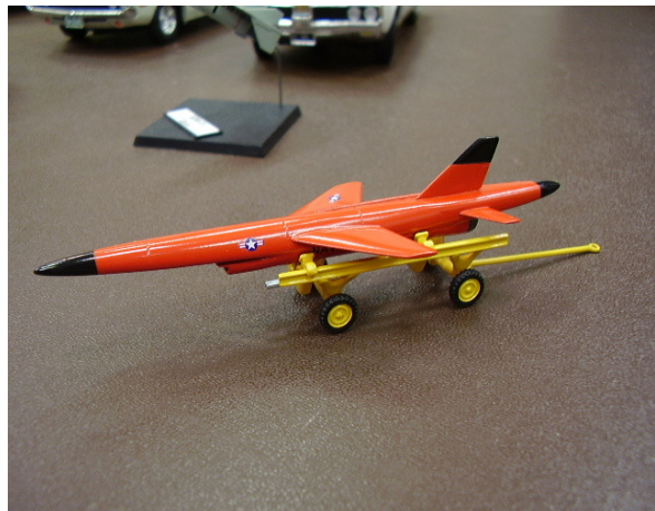
1/72 12 Squared BGM-34F Firebee Drone-Al Magnus