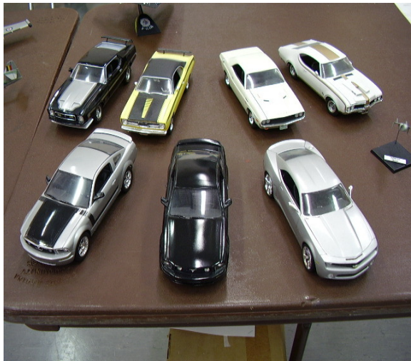
Impressive collection of heavy metal by Patrick Elkington