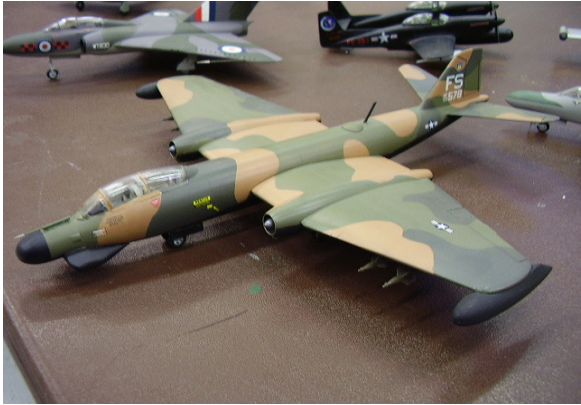
1/72 Italeri B-57G Canberra-Neil Hill