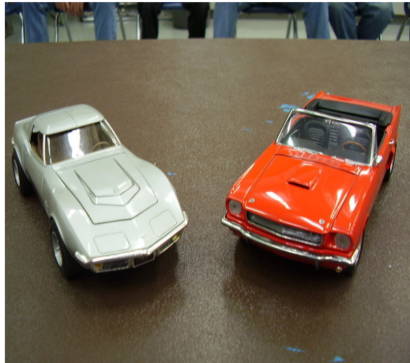
1/25 '66 Shelby GT 350 and '70 Corvette ZR-1-Leith James