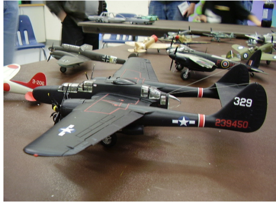
1/48 Revell P-61B Black Widow-Michael Evans