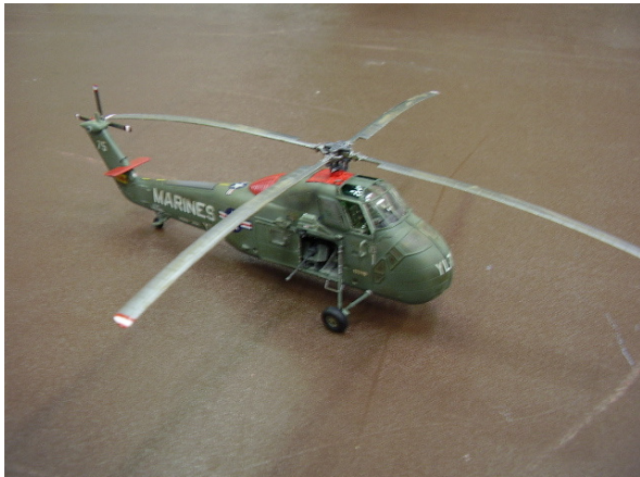
1/72 Italeri UH-34D-Larry Draper