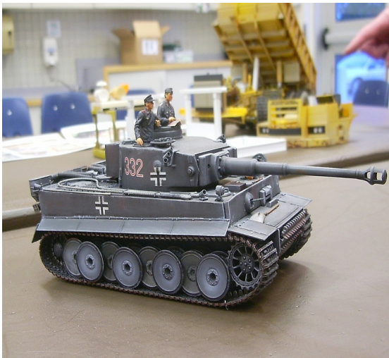
1/35 Tiger I-Michael Evans