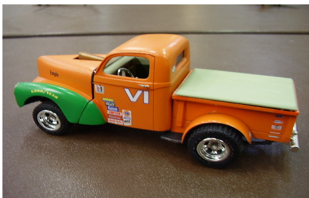
Ted McPherson's AMT 1/25 scale Willys 1940 Pick Up Truck.