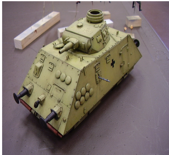
1/35 Panzerartzwagon-Cam Barker