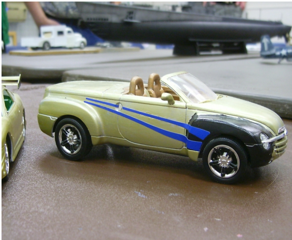
1/25 Chevy SSR-Michael Cameron