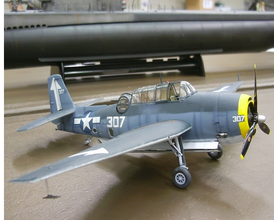
1/48 AM TBM-3-Michael Evans