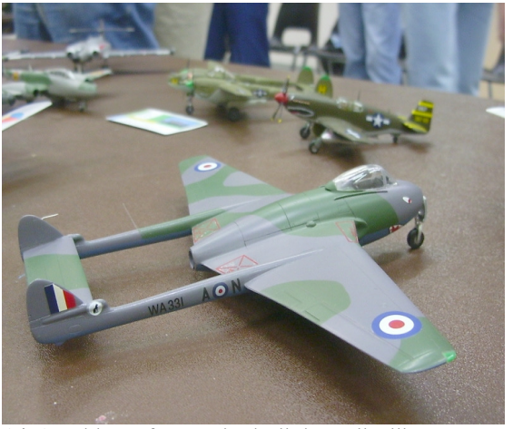
1/48 Hobbycraft Vampire built by Neil Hill