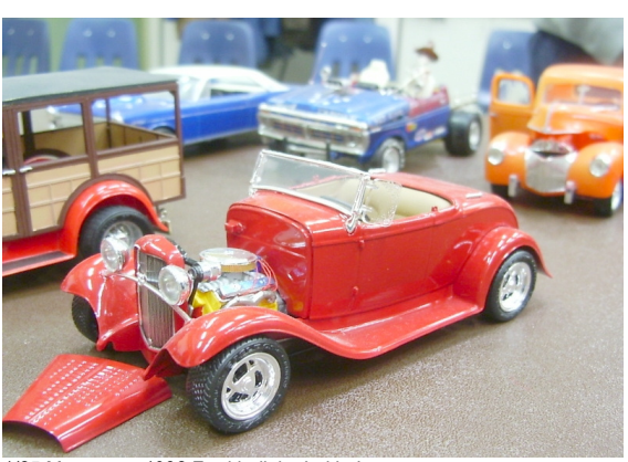
1/25 Monogram 1932 Ford built by Leith James