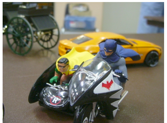
Dave Kapp's 1/25 Polar Lights Bat Cycle