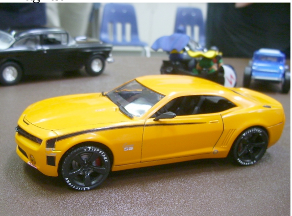
Larry Draper's 1/25 AMT Camaro 06