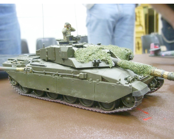
Tamiya 1/35 Challenger MBT built by Cam Barker