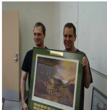
2007 Armour Modeller of the Year