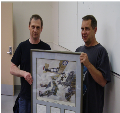
2007 Aircraft Modeller of the Year