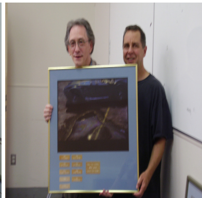
2007 Automotive Modeller of the Year