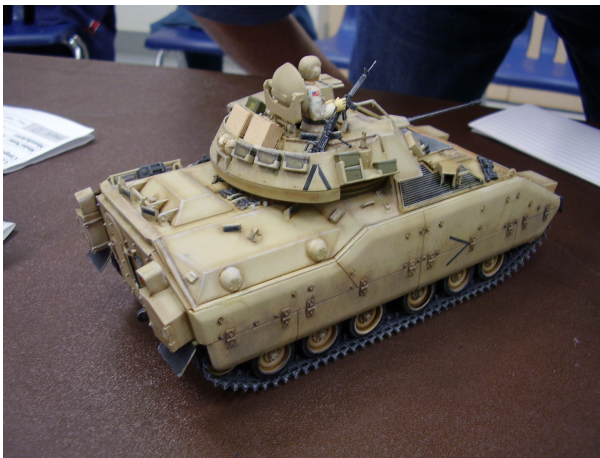
Bradley AFV-Unknown Builder