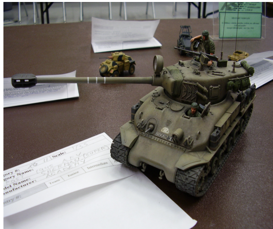
Super Sherman-Dave Porter