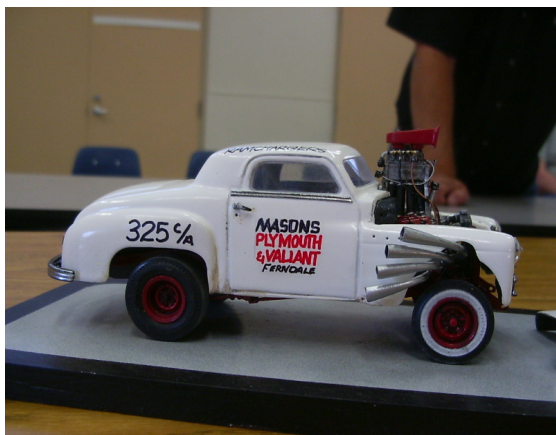
1/25 AMT 49 Plymouth Coupe built by William Yee