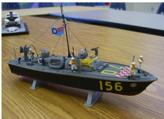
1/72 Airfix RAF Rescue Boat built by Ted Upcott