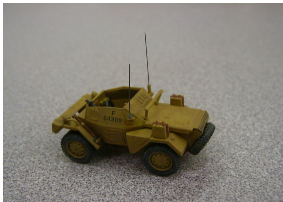
1/72 nd Matchbox Daimler Dingo built by Al Magnus