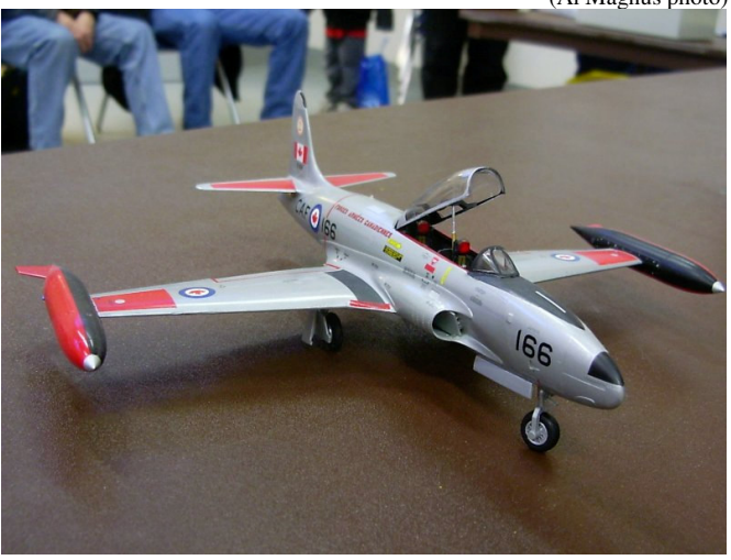
Colin Kunkel's CT-133 Silver Star