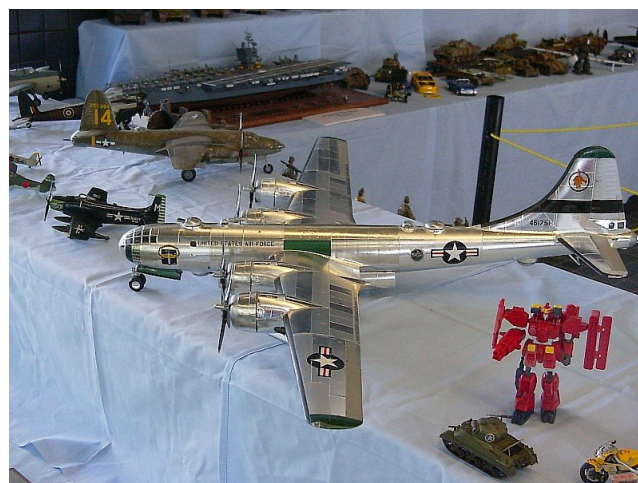
Michael Evans' foil covered 1/48 scale B-29