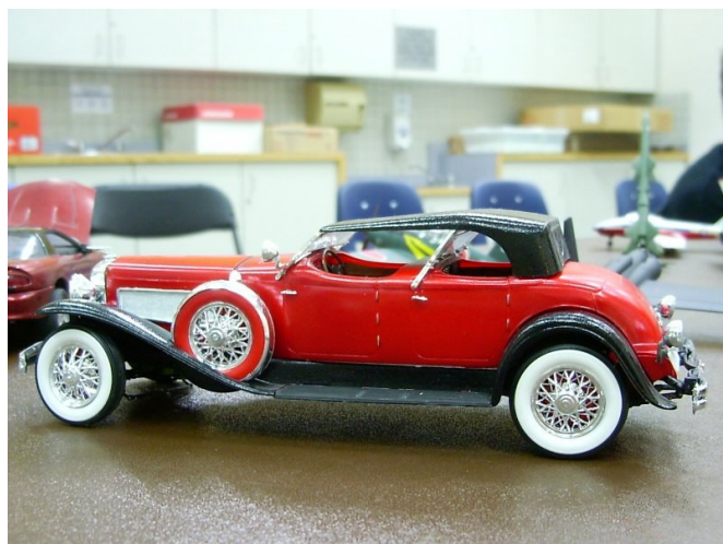
Ted McPherson's Revell 1/24 scale 1934 Duesenberg

Tamiya 1/48 scale Mosquito in ace Russ Bannock markings, Monogram 1/48 scale Typhoon in 440Sq. markings, 1/72 scale Revell F-16 in Thunderbirds markings and Hobbycraft 1/72 scale Tutor in Snowbirds markings