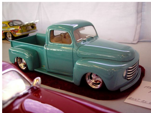
Ed Kereluk's customized pickup