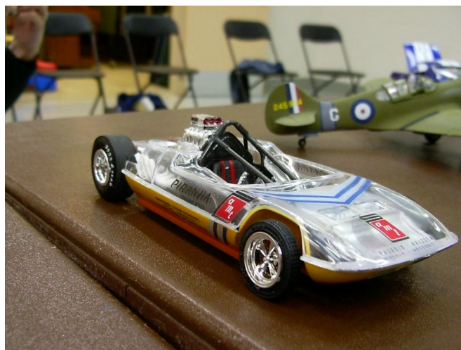
Dave Kapp's 1/25 scale AMT Piranha Funny Car