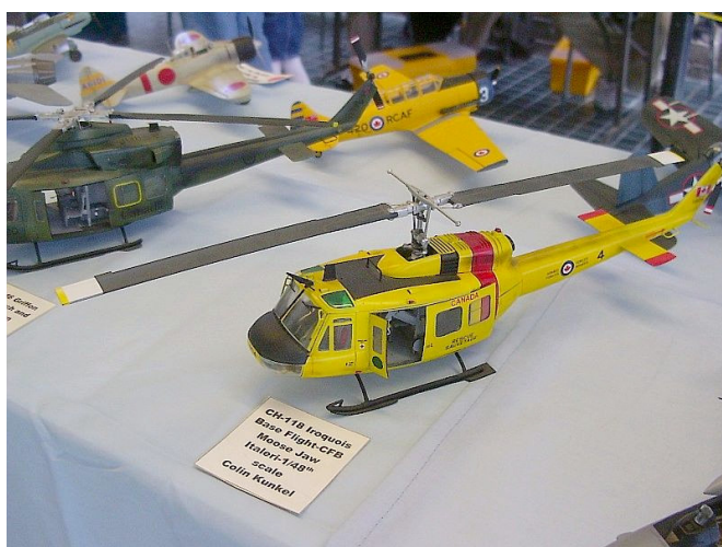
Colin Kunkel's 1/48 scale CH-118