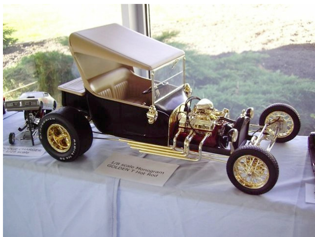
Curfew James' 1/8 scale Big T