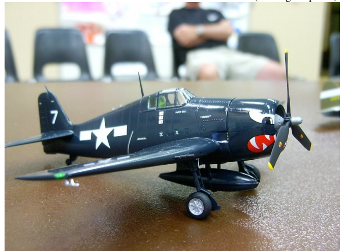
Al Magnus' 1/72 scale Academy F6F Hellcat