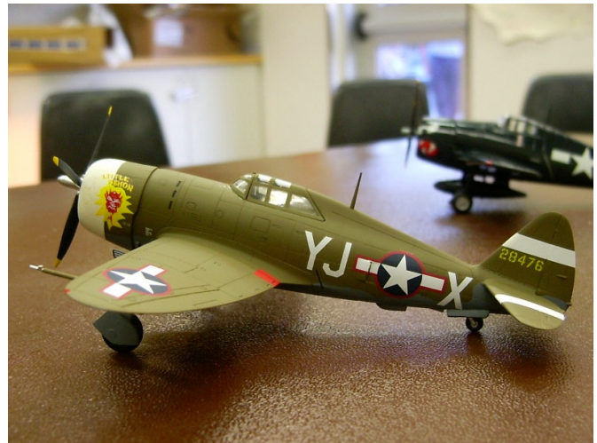
Al Magnus' 1/72 scale P-47D Thunderbolt razorback