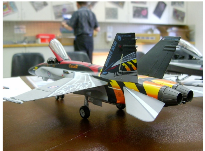
Four of Colin Kunkel's very colourful CF-18 fighters present at the August meeting