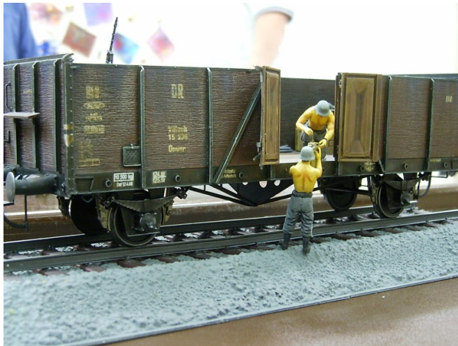
Michael Evans' German Type OMMR rail car

Elden Conley: A selection of circa-1980's Military Modelling magazines.