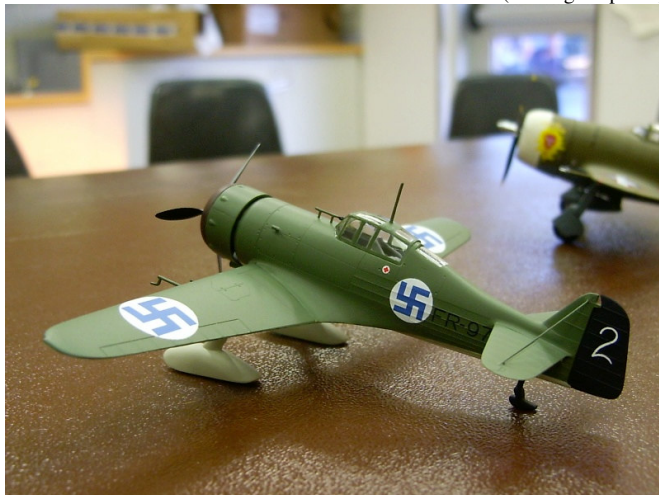
Al Magnus' 1/72 scale Fokker D.XXI