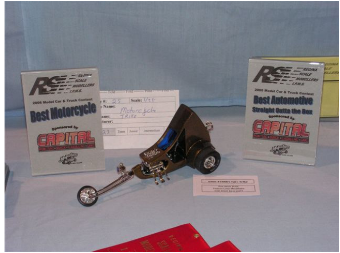
Dave Kapp' s Taco Trike - Best Motorcycle & Best Auto Straight Out of the Box winner