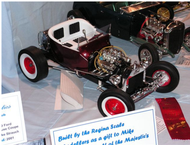
Dave Kapp' s Big Red Rod - Best Large Scale Auto winner