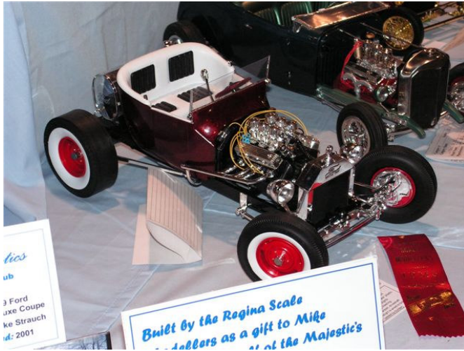
Dave Kapp' s Big Red Rod - Best Large Scale Auto winner