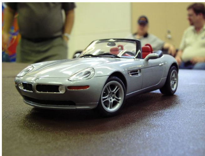
Rob Wheeler' s 1/24 scale Revell BMW Z8