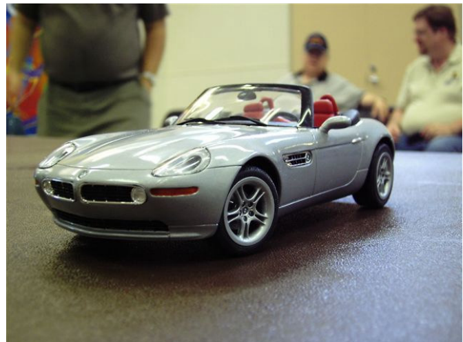
Rob Wheeler' s 1/24 scale Revell BMW Z8