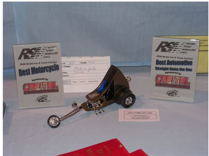
Dave Kapp' s Taco Trike - Best Motorcycle & Best Auto Straight Out of the Box winner