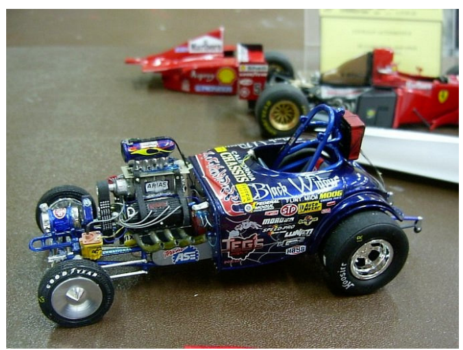
Modellers' Choice winner - Larry Draper's Black Widow dragster