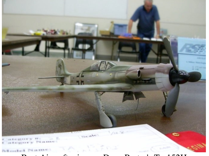
Best Aircraft winner - Dave Porter's Ta-152H