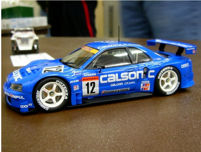
Leith James' Tamiya 1/24 scale 2003 "Calsonic" Nissan Skyline