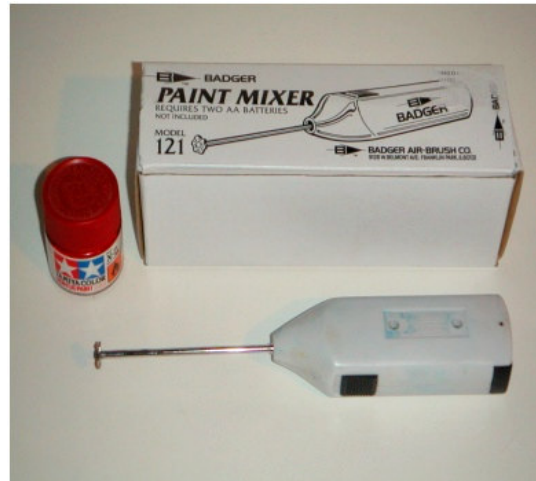
Badger Paint Mixer

You are looking at a Robart Hobby Paint Shaker. These are fairly new on the market and can be acquired from good hobby shops, such as Red Line Hobby. If you have had trouble in the past mixing up your paints, here is a great solution. All you do is strap in your jar of paint, push the button and let it shake. It works similar to the larger paint shakers you find in paint stores. The nice thing about this is once your paint is shaken up, it seems to stay mixed longer. It does a really thorough job, so you have a consistent colour throughout. Another good thing, if you're mixing colours you also get a good mix and no air bubbles. I recommend it if your paint is very thick on the bottom (old). Stir it with a stick first, close the lid, strap it in and let it shake. The results are amazing. I honestly wouldn't be without one.