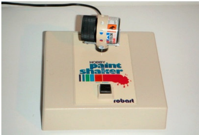
Something new for the Hobbyist

You are looking at a Robart Hobby Paint Shaker. These are fairly new on the market and can be acquired from good hobby shops, such as Red Line Hobby. If you have had trouble in the past mixing up your paints, here is a great solution. All you do is strap in your jar of paint, push the button and let it shake. It works similar to the larger paint shakers you find in paint stores. The nice thing about this is once your paint is shaken up, it seems to stay mixed longer. It does a really thorough job, so you have a consistent colour throughout. Another good thing, if you're mixing colours you also get a good mix and no air bubbles. I recommend it if your paint is very thick on the bottom (old). Stir it with a stick first, close the lid, strap it in and let it shake. The results are amazing. I honestly wouldn't be without one.