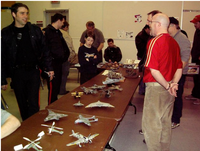
The local constabulary eyeing the more sinister members of the club