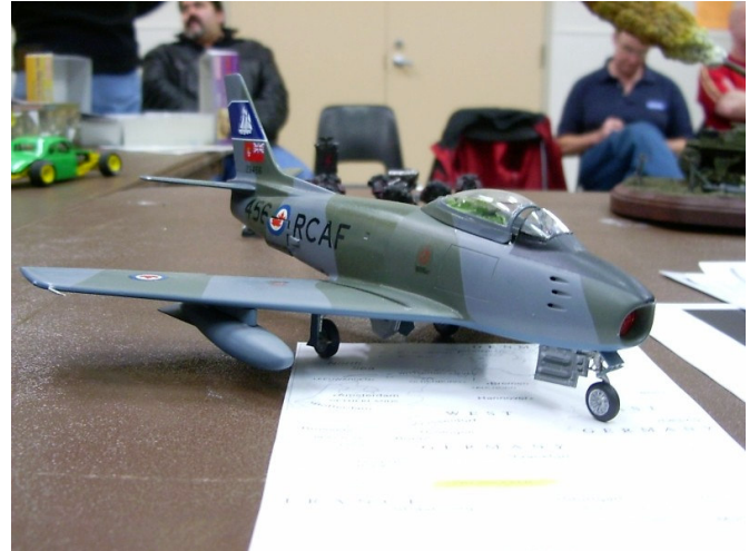
Frank Turgeon's 1/48 scale RCAF F-86