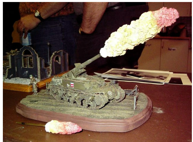
Barry Novak's 1/35 scale M12 SPG spittin' fire