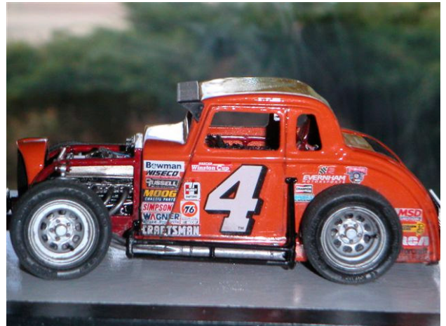
William Yee's scratchbuilt '34 Dodge Coupe - Best Scratchbuilt or Conversion winner