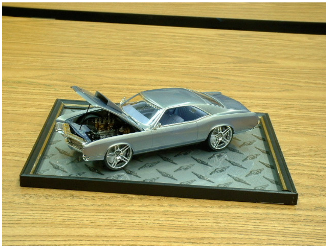
Ron Gall's Buick Riviera (AMT kit)