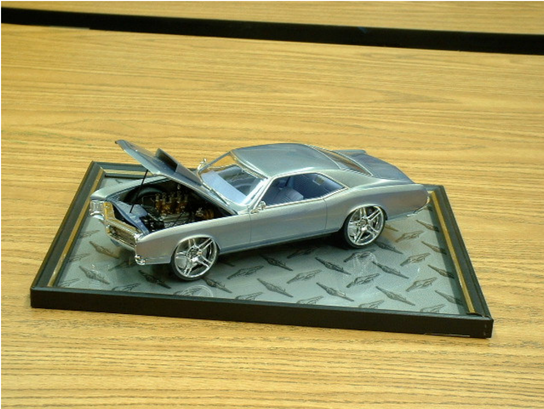
Ron Gall's Buick Riviera (AMT kit)